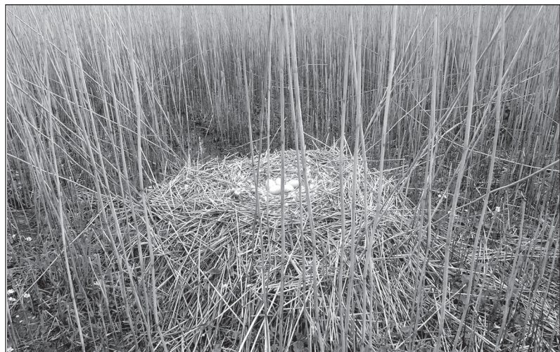
Figure 11.2: A 'natural' platform – swan's nest

After discussing how we can interpret con-