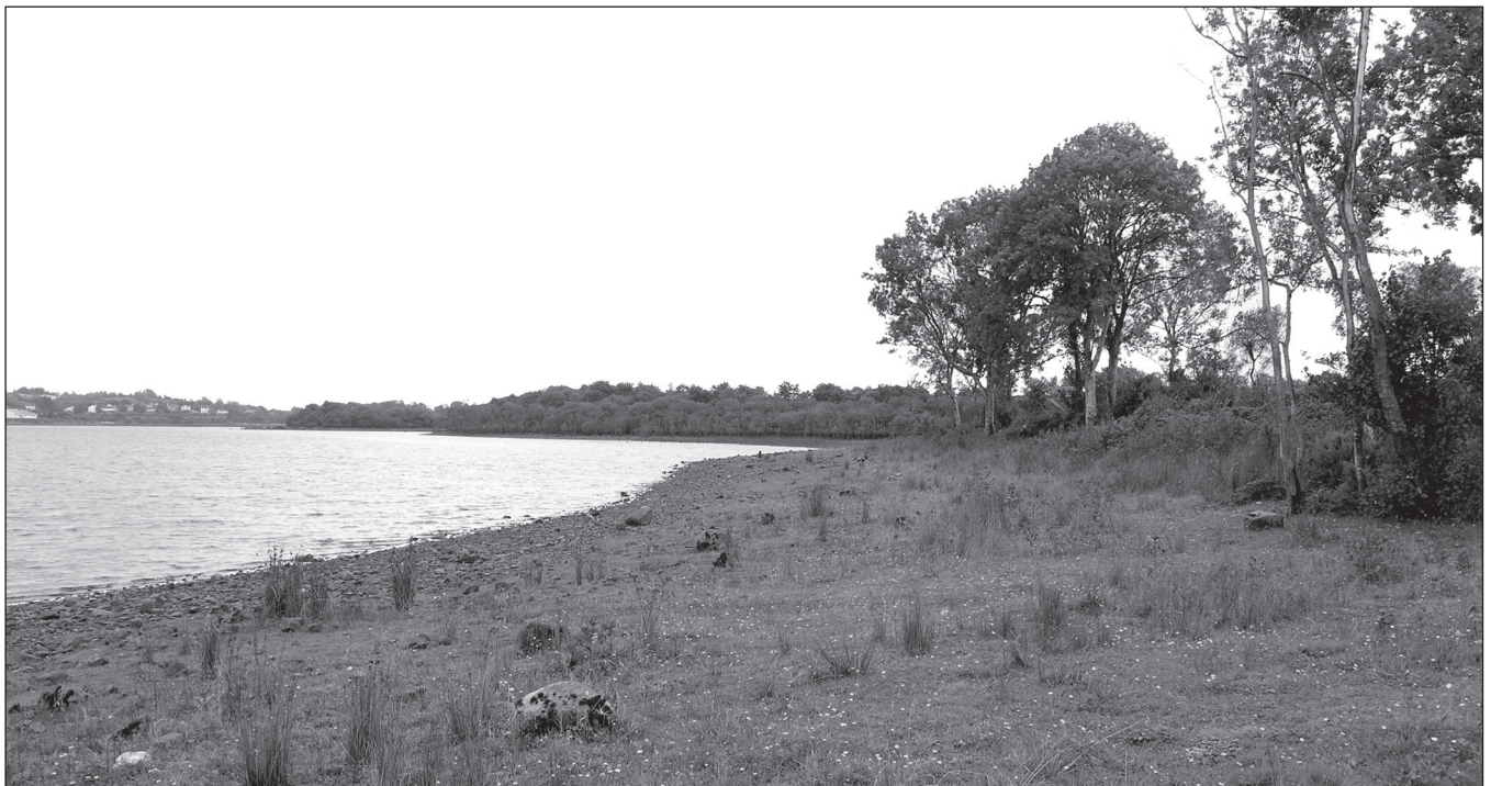
Figure 11.4: Mahanagh, with R. Shannon exiting to left

While the asperity of Childe’s remark probably